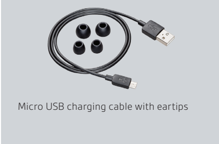
Micro USB charging cable with eartips